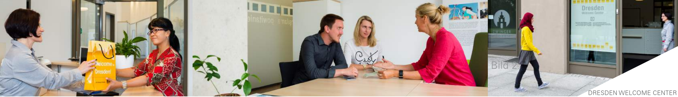
DRESDEN WELCOME CENTER